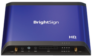
Expanded I/O Package