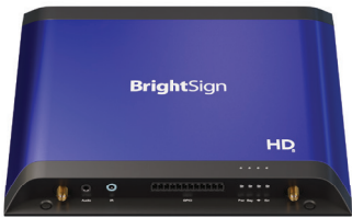
Standard I/O Package