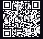
TRB142 360° VIEW

// TRB142 comes with a widely used RS232 interface for remote device management.