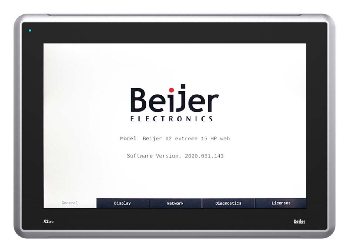
X2 pro 15 web