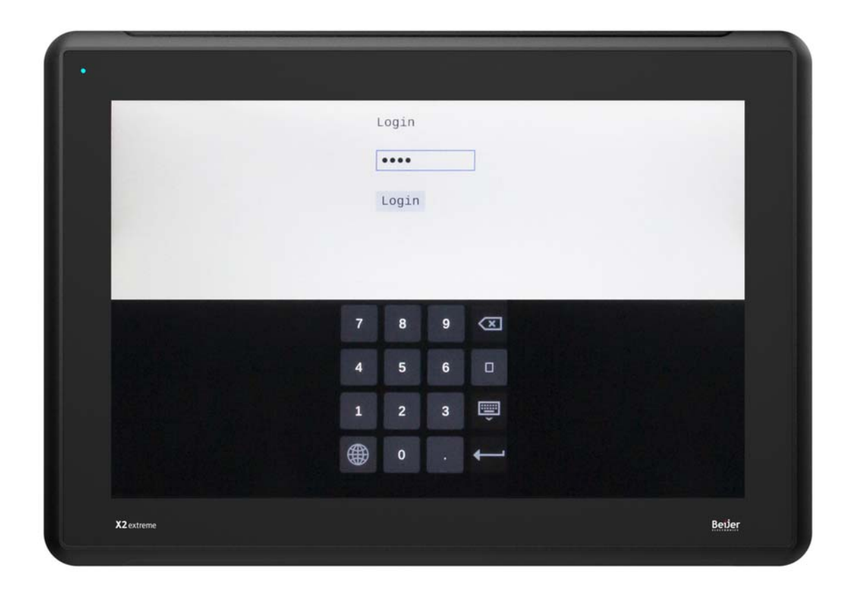
X2 extreme 15 web