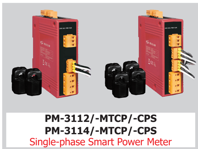
PM-3112/-MTCP/-CPS PM-3114/-MTCP/-CPS Single-phase Smart Power Meter