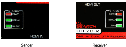
Figure 3 – LED indicators

Both the sender and the receiver have LED status indicators that can assist you in determining the causes of potential problems.