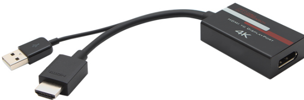
Model GC-HD-DP: HDMI source to DisplayPort output

Virtually all monitors and TVs have HDMI (or DVI) inputs, but if your display only has Display port input, the following adapter converts HDMI to DP.