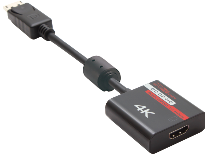
Model GC-DP-HD: DisplayPort source to HDMI output

To connect to a source (PC) with Displayport output, use GC-DP-HD.