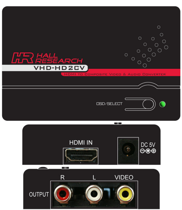
Figure 2 – Top, Input, and Output views