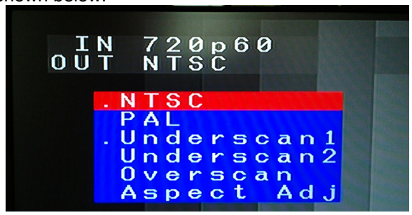
Figure 4 – Advanced Settings Menu

While the Status OSD is being displayed, press and hold the OSD/SELECT button for 3 seconds to bring up the advanced settings Manu as shown below.