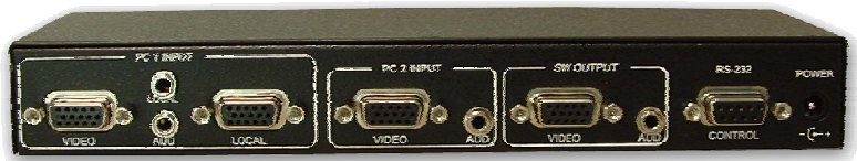
VS-2A Rear Panel

Select the desired mode of operation including the priority for your video and audio output using the front panel switched buttons. If preferred, the selection can also be done through RS-232 serial commands by connecting a DB9 RS-232 Serial cable to your PC and the VS-2A.